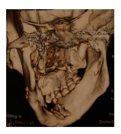
Figure 2: 3D view revealed the displaced bone with the level of lower border is due to muscle retraction. The tubercles are clearly visible directed medially.

An operation was done for correction of the displaced bone, not for removal. Vestibular incision was done in the sympheseal region through the mentalis muscle. The plates were removed and clean the granulation tissue in the area of fracture. The mandible was separated at the missing alveolus by electrical saw. The separated lingual bone was hold with wire. The mandible was fixed with miniplate. The lingual bone was placed into its original place with position screw. The tubercles on the midline felt in place being parallel to the level of other side. The mentalis muscle was sutured with 2-0 vecryl. The patient was discharged from hospital in the next day. Follow-up at 6 months revealed complete symptomatic recovery, and improved normal mobility of the tongue.