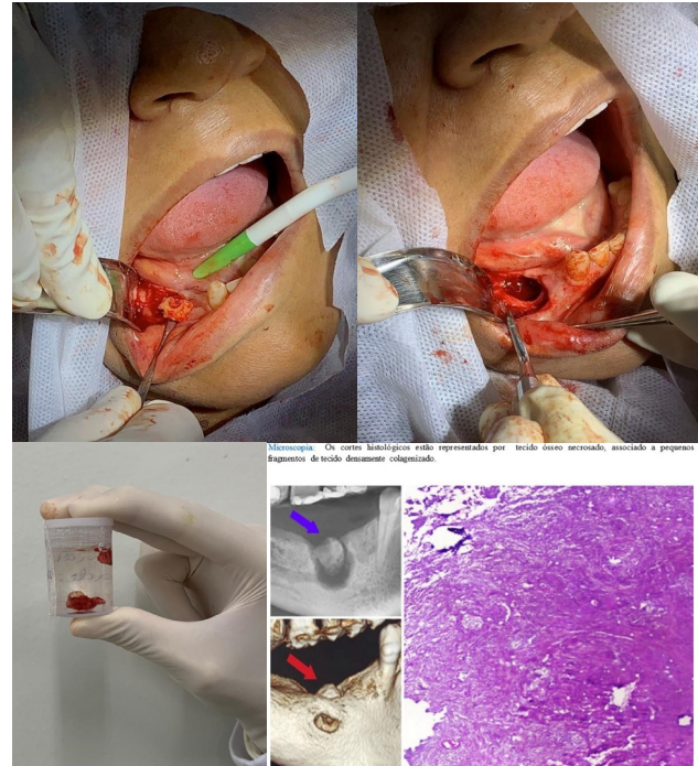
Figura 3 - A – Removal of necrotic bone tissue; B – Cavity tissue removal and curettage; C – Specimen into the container with 10% formalin; D – Histopathological diagnosis.

Adding the information obtained in the anamnesis to the clinical history and images provided by the CT, we opted for an excisional biopsy to even remove healthy bone tissue (Fig. 3a e 3b). The specimen was fixed in 10% formalin solution and sent for histopathological examination (Fig. 3c), the report being compatible with the MO in which the histological sections are represented by necrotic bone tissue, associated with small fragments of densely collagenized tissue (Fig. 3d).