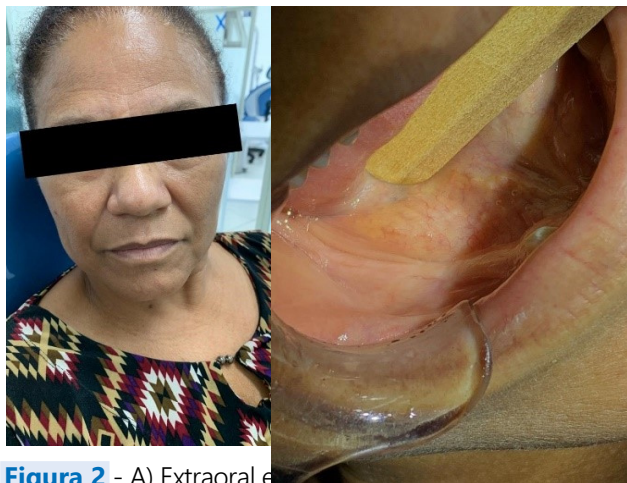
Figura 2 - A) Extraoral e

The patient was referred to the Oral and Maxillofacial Pathology Outpatient Clinic of the Faculty of Dentistry of Gurupi (UNIRG) for a careful evaluation; however, she only attended the School Clinic in 2021. On clinical examination, no extraoral changes were identified, however, in the oral cavity there was the presence of bulging of the cortical bone without other significant signs (Fig. 2a and 2b). The patient reported chronic pain and said she had been on systemic antibiotics for several days.